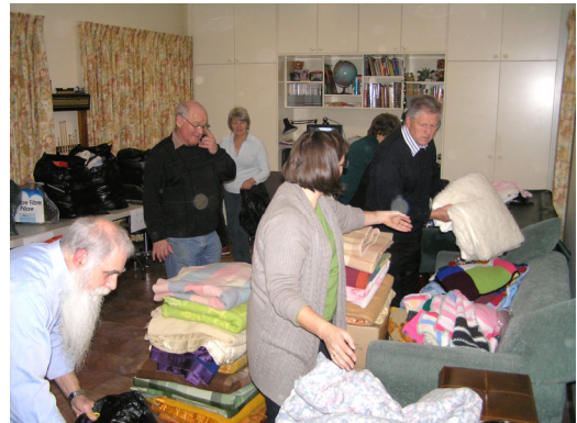
Sorting "Winter Woolies"