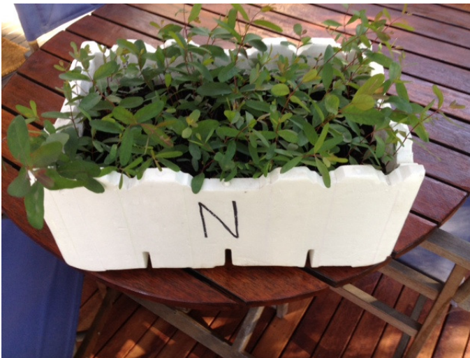
Nigel's emerging forest