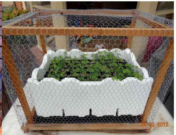
Joe's seedlings well protected