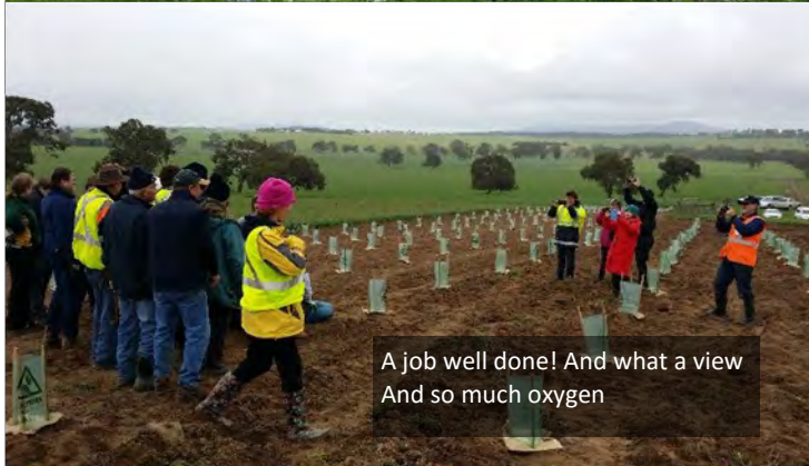
A job well done! And what a view And so much oxygen