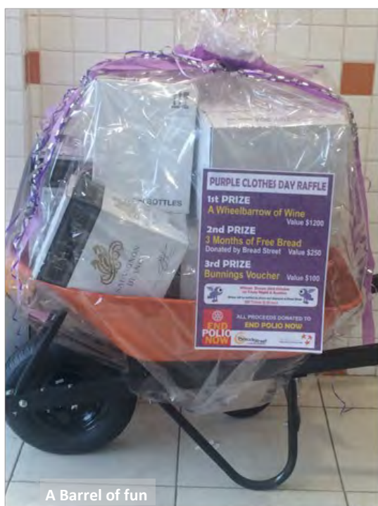
A Barrel of fun