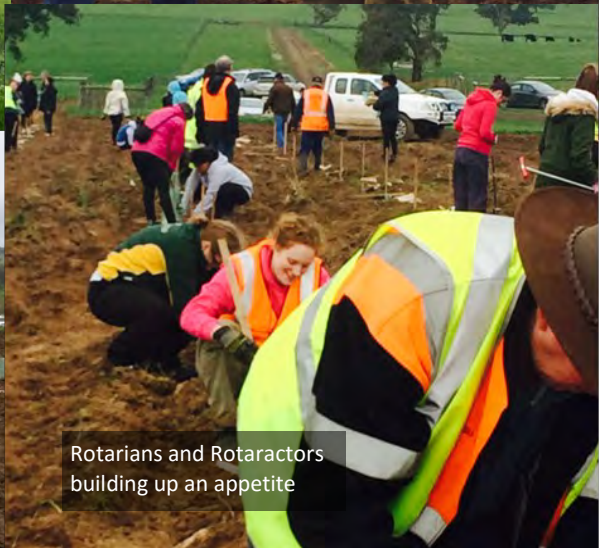
Rotarians and Rotaractors building up an appetite