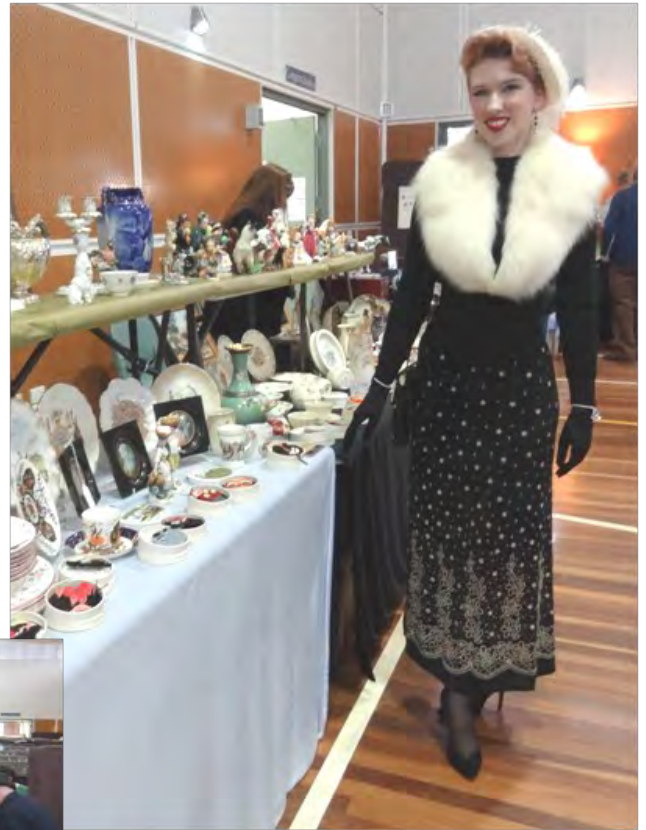
Miss Antiques, Retro and Collectables 2016

The organisation for a fair like this takes a lot of time, plenty of preparation, many phone calls, emails, planning and, of course, hard work setting up and packing up at the end. It was fantastic to see the teamwork from club members - 22 or 92% assisted in some way. In addition, 9 Interactors and 14 Friends of the Club volunteered and our thanks go to all involved.