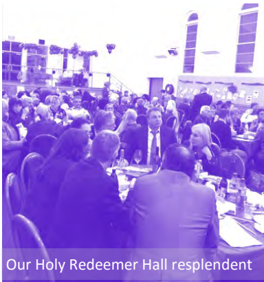
Our Holy Redeemer Hall resplendent

We raised over $8600 from the week's activities, which equates to over $25,000 towards the fight against polio, given the generous support from the Bill and Melissa Gates Foundation which donates $2 for everyone $1 we raise.