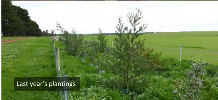
Last year's plantings