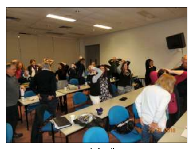
Heads & Tails