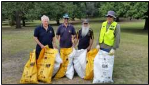
Clean up Australia Day team

On Clean Up Australia Day, we again showed our community support by removing rubbish from Kingsley Gardens. We were joined by a number of non-Rotarians.