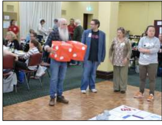
Rotaract Giant Monopoloy Night