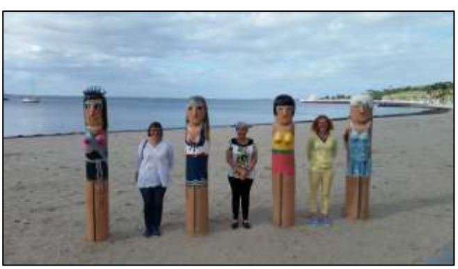
Conference ladies on the foreshore