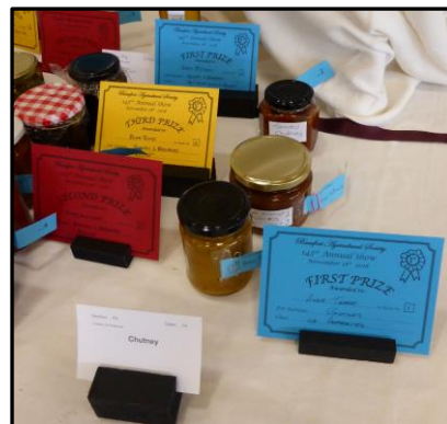
MASH winning Chutney