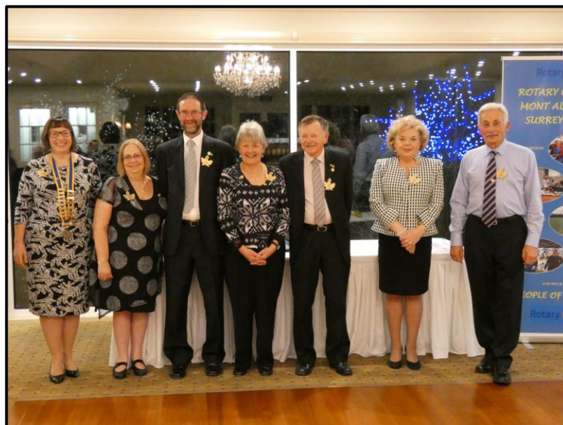
Members of 2018-19 Board at Changeover Night, June 2018.