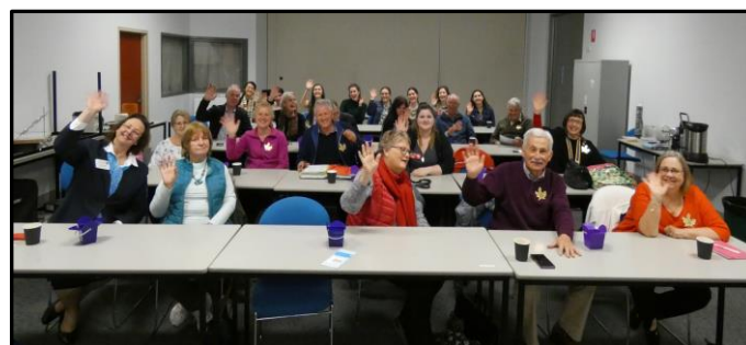
The MASH audience.