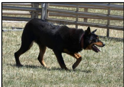
Sheep dog trials.