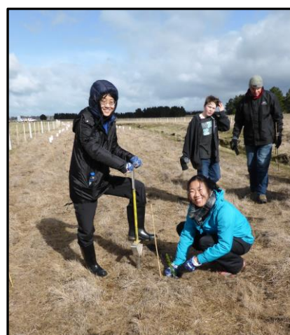
Whitehorse Rotaractors helping at MASH RAC Fair and tree planting in Beaufort.