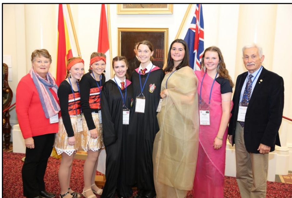
MUNA teams from Koonung and Beaufort Secondary Colleges